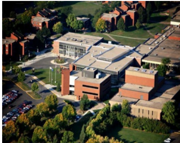
Figure 2 Aerial image of Southwest Minnesota State University in the Fall