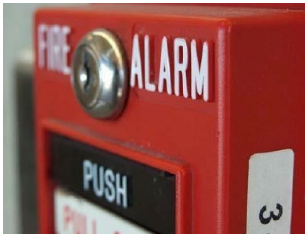
Figure 3 Picture of a wall mounted fire alarm

The Higher Education Opportunity Act (HEOA) was signed into law in August 2008 and contains several crucial campus safety components. One of the main provisions of the HEOA is the Campus Fire Safety Right-to-Know Act. This provision calls for all Title IV eligible institutions that participate in Title IV programs and maintain on-campus student housing facilities to publish an annual fire safety report that outlines fire safety systems, policies, practices, and statistics. The following report discloses all information required by HEOA as it relates to Southwest Minnesota State University.