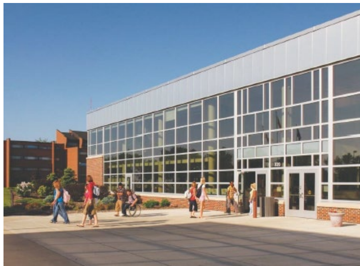
Figure 4 Picture of the Student Center of Southwest Minnesota State University