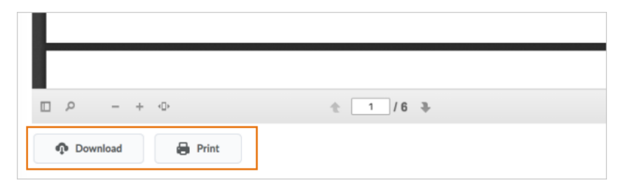
Figure: The Download and Print buttons as they appear in the Overview area